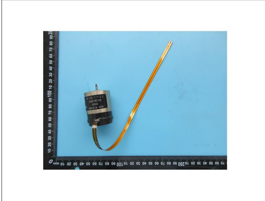
The test results of SVHC over limit in the submitted sample summary